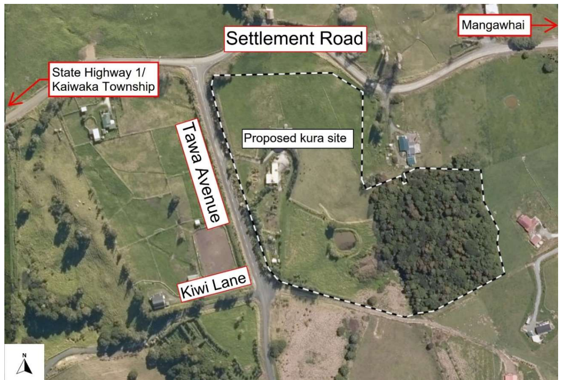
Figure 2: Site plan

4.3 Tawa Avenue (on the proposed Kura frontage) between Settlement Road and Kiwi Lane is a two-lane, sealed, no-exit road and is classified as a 'Local Road' in the Kaipara District Plan (KDP) and the posted speed limit is currently 100 km/h. Information within the 2021 Kaipara District Council (KDC) Regional Speed Limit