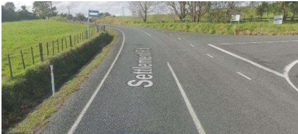
Figure 4 Extract from Google street view of Settlement Road/Tawa Avenue intersection

scope to widen within the road reserve will result in the shoulder being constructed on an adverse camber, which I consider to be a significant safety risk especially as vehicles would be travelling around the inside of a bend. To remove this camber would require infilling of the existing ditch which forms the function of a surface water drain. The narrow width of the existing road reserve would make it difficult to infill the ditch to remove the camber. It is for these reasons that I consider that the intersection was most likely originally constructed without a shoulder and why the sealing of Settlement Road (undertaken a few years ago) did not include sealing to create a shoulder at this intersection. As demonstrated in paragraph 4.8, this intersection operates safely without a shoulder. In my opinion the widening suggested in the KDC Engineering report could not be delivered without third party land which KDC would need to designate for road widening purposes.